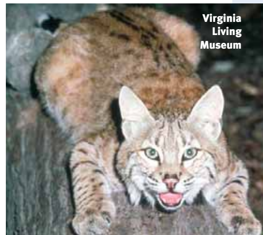
Virginia Living Museum

524 J. Clyde Morris Boulevard, Newport News, VA 23601. 757/595-1900. Explore the nature of Virginia. Observe animals swim, slither, roam, and fly in natural habitats, plus explore the universe in the planetarium. New exhibit building features walk-through habitats, galleries, hands-on discovery areas, an observatory and more. www.valivingmuseum.org