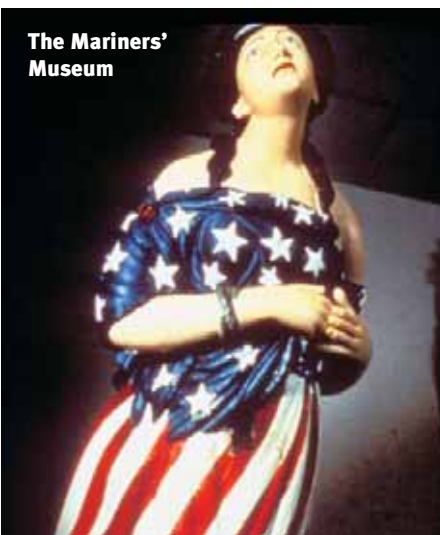
The Mariners' Museum

100 Museum Drive, Newport News, VA 23606, 757/596-2222 or 800/581-7245. Home of the USS Monitor artifacts, the Mariners' Museum houses an international maritime collection ranging from mahogany Chris-Crafts to the Monitor's revolving gun turret. www.mariner.org