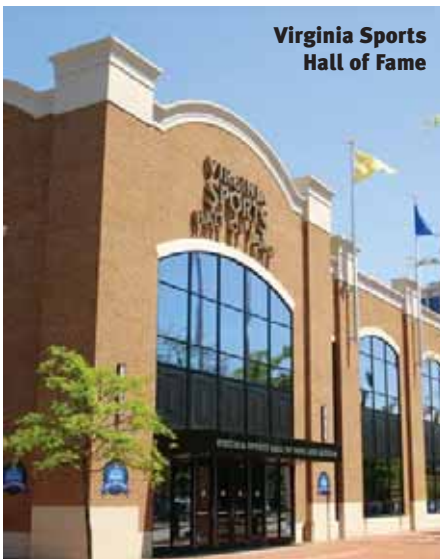
Virginia Sports Hall of Fame

206 High Street, Portsmouth, VA 23704. 757/393-8031 This 35,000 square-foot new facility features baseball, basketball, football and soccer activities, a training room with participatory games and equipment, as well as auto racing computer simulators to give visitors a feeling for what it's like to sit behind the wheel of one of Virginia's race tracks. The facility also boasts a 125-seat high-definition digital theater. www.vshfm.com