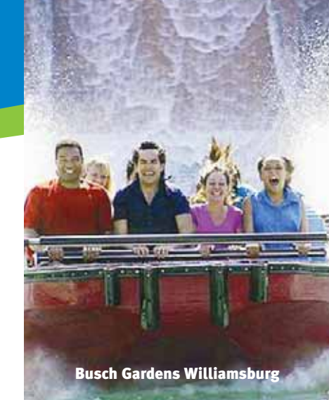
Busch Gardens Williamsburg

acres of outdoor marsh habitat, nature walk and over 350 hands-on exhibits. Visitors can also experience "bigger-than-life" nature and marine movies in the 3-D IMAX Theater. www.vmsm.com