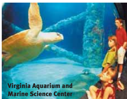
Virginia Aquarium and Marine Science Center

717 General Booth Blvd. Virginia Beach, VA 23451, 757/437-4949. The museum features 800,000 gallons of aquariums, live animal habitats, outdoor aviary, ten